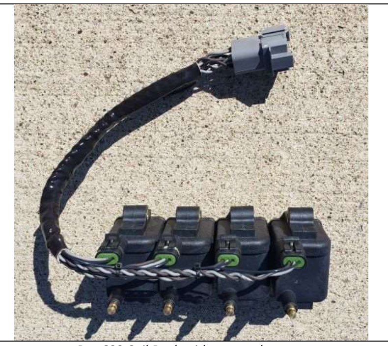
Pro-600 Coil Bank with custom harness