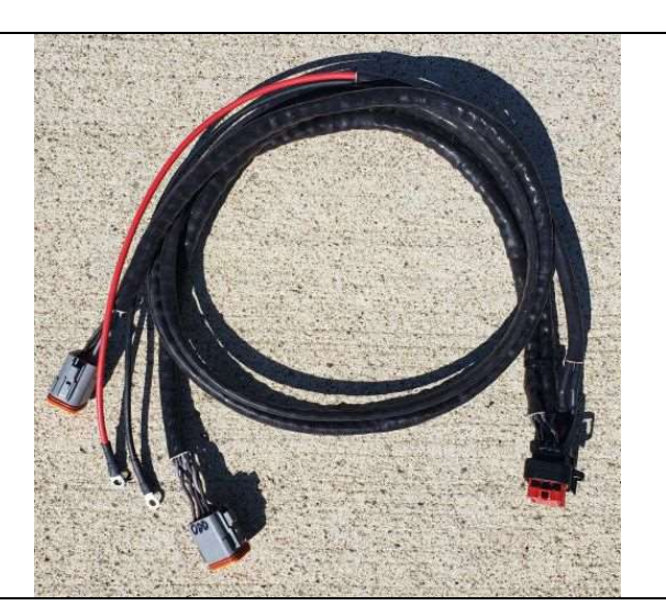
Pro-600 Output cable