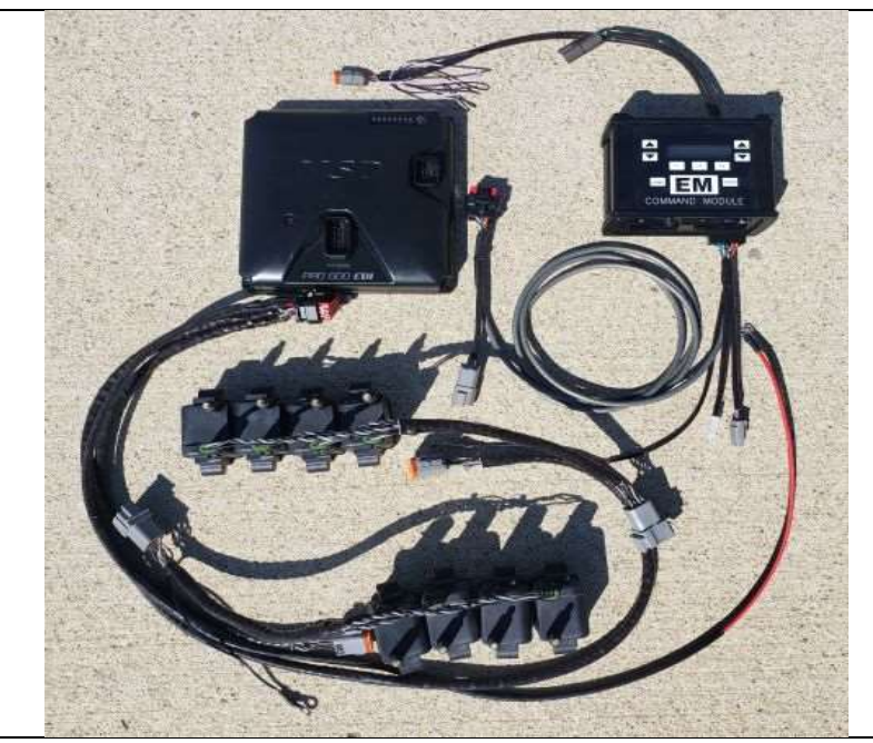
MSD- Pro-600 With EM Command Module